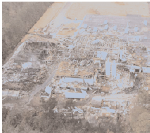
A pharmaceutical plant after a dust explosion.

An initial (primary) explosion in processing equipment or in an area where fugitive dust has accumulated may dislodge more accumulated dust into the air, or damage a containment system (such as a duct, vessel, or collector). As a result, if ignited, the additional dust dispersed into the air may cause one or more secondary explosions. These can be far more destructive than a primary explosion due to the increased quantity and concentration of dispersed combustible dust. Many deaths in past accidents, as well as other damage, have been caused by secondary explosions.