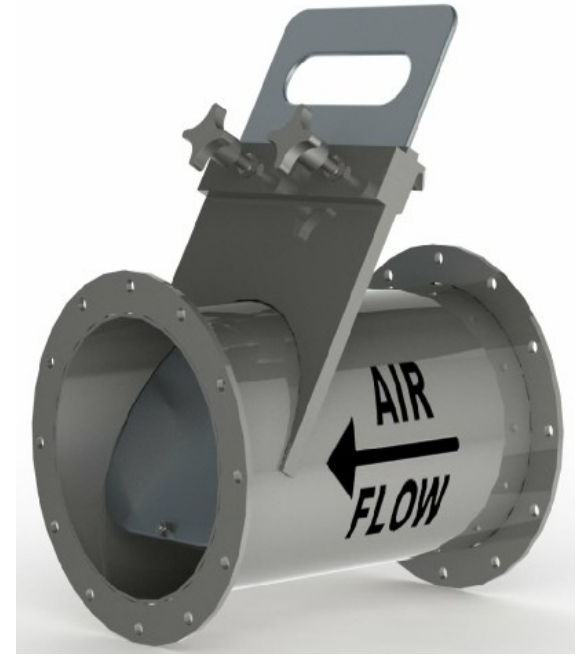
BALANCE SLIDE GATE

64 CIRCLE FREEWAY DR CINCINNATI, OH 45246 www.atmos360.com Phone: 513-330-5442 E-mail: info@atmos360.com