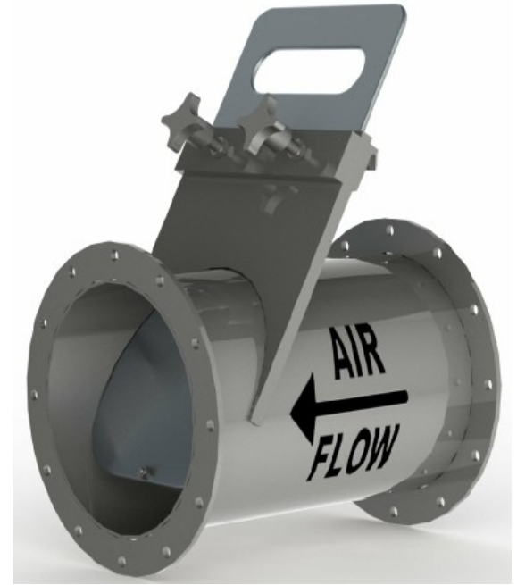
BALANCE SLIDE GATE

64 CIRCLE FREEWAY DR CINCINNATI, OH 45246 www.atmos360.com Phone: 513-330-5442 E-mail: info@atmos360.com